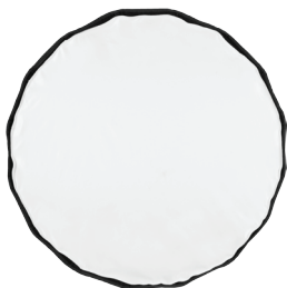
FULL-STOP DIFFUSION PANEL