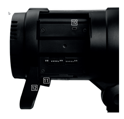
10. USB port