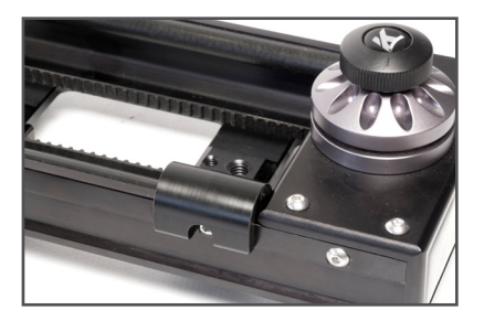
Step 2 Place Parallax rail underneath camera slider and line up to corresponding screw holes