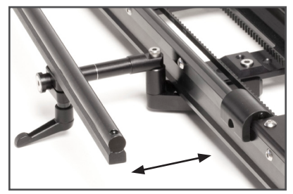
Step 6 Collapse Parallax cart towards bearing assembly and slide Parallax bearing assembly over the Parallax rail from the slider's drag end