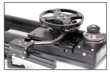
Step 7 Align bottom 3/8" stud of Parallax cart with hole on slider carriage as shown