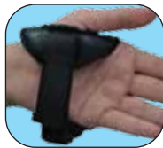
Tighten by pulling the velcro