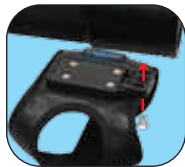
Fix the glove on the light with the supplied screw